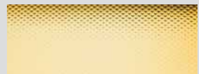
PVC and EPDM membrane